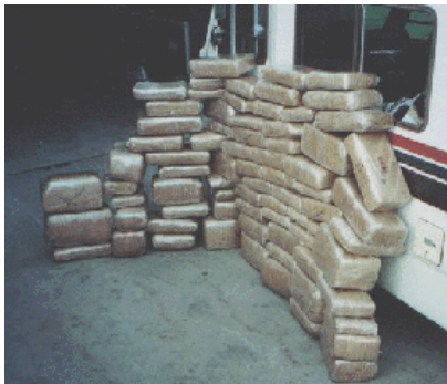
Over 1000 lbs. of marijuana seized by an officer who uses the techniques.